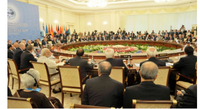
Prime Minister attends SCO Summit

Prime Minister Modi offered floral tributes at the bust of former Prime Minister Late Shri Lal Bahadur Shastri and interacted with the kids at Shastri Street in Tashkent on June 24, 2016.