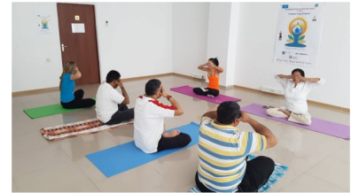
Celebration of the 2nd International Day of Yoga in Atyrau