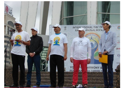
Celebration of International Day of Yoga in Astana