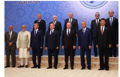
Group Photo of SCO leaders