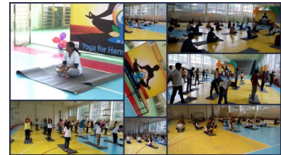
Celebration of the 2nd International Day of Yoga by KAISA in Almaty