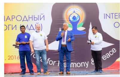
Celebration of International Day of Yoga in Almaty